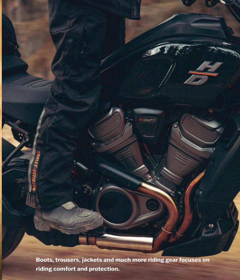
Boots, trousers, jackets and much more riding gear focuses on riding comfort and protection.