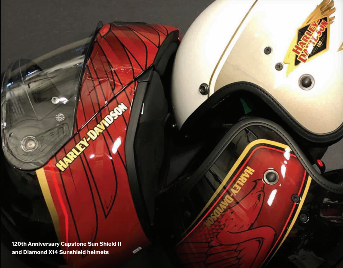
120th Anniversary Capstone Sun Shield II and Diamond X14 Sunshield helmets

2023 marks the 120th Anniversary of Harley-Davidson®. This extra special chapter in our history will be a time to celebrate and create memories. Our exclusive range of distinctive 120th Anniversary Harley-Davidson® MotorClothes® gear and apparel will go some way to make those memories last forever. Just like our motorcycles, the 120th Anniversary apparel line-up is impressive with something for everyone. From helmets to gloves, Tees to riding jackets and more, each carefully selected piece will feature a unique 120th Anniversary logo. Memories are made. Make yours today.