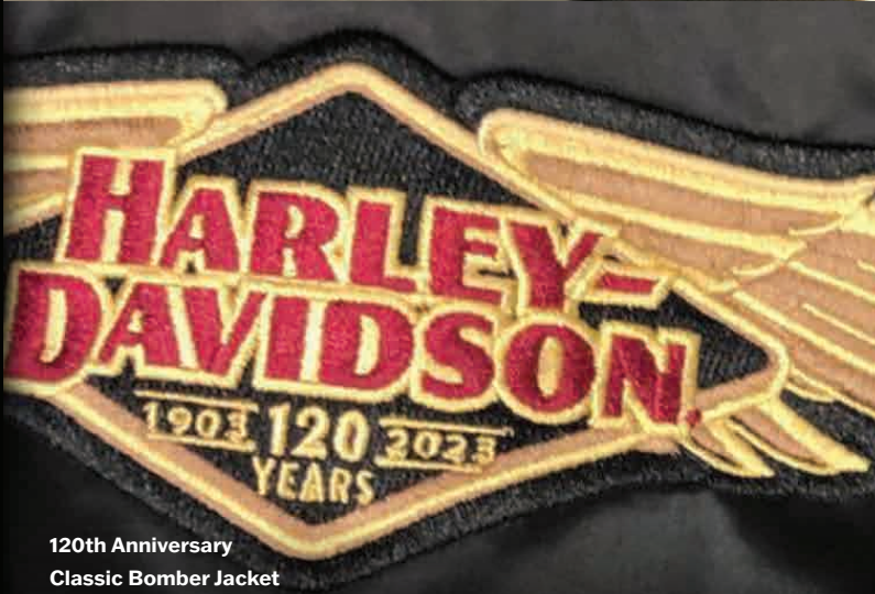
120th Anniversary Classic Bomber Jacket