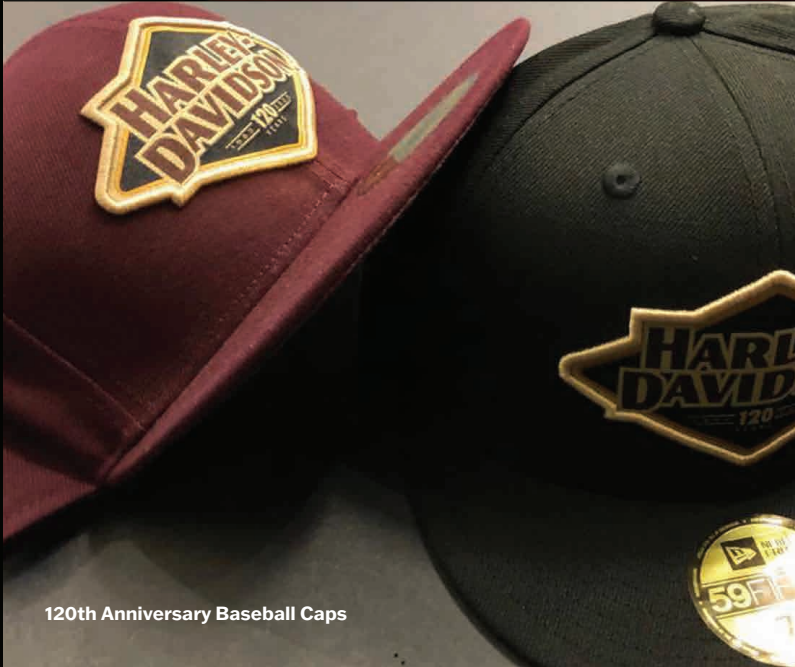
120th Anniversary Baseball Caps