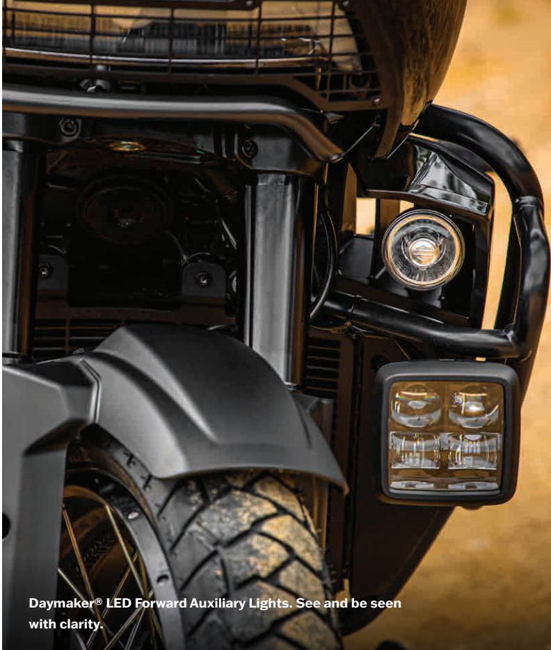
Daymaker® LED Forward Auxiliary Lights. See and be seen with clarity.

Owning and riding a Pan America™ is just the start of your next adventure. Make sure you're equipped with Harley-Davidson® Genuine Parts & Accessories and riding gear before you start exploring. Night or day. Hot or cold. Smooth roads or off-road mountain tracks. You'll find everything you need at your local H-D® dealership.