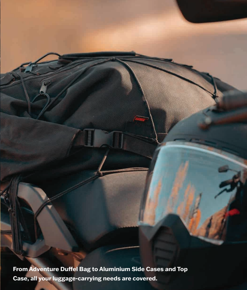
From Adventure Duffel Bag to Aluminium Side Cases and Top Case, all your luggage-carrying needs are covered.