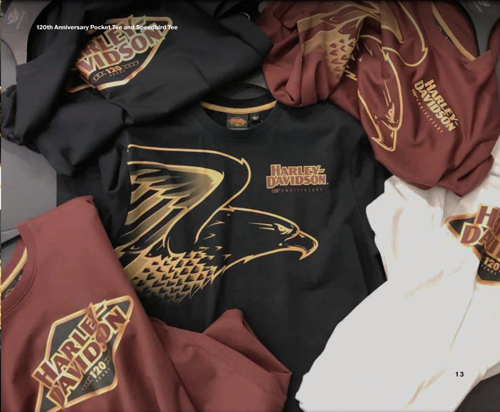
120th Anniversary Pocket Tee and Speedbird Tee