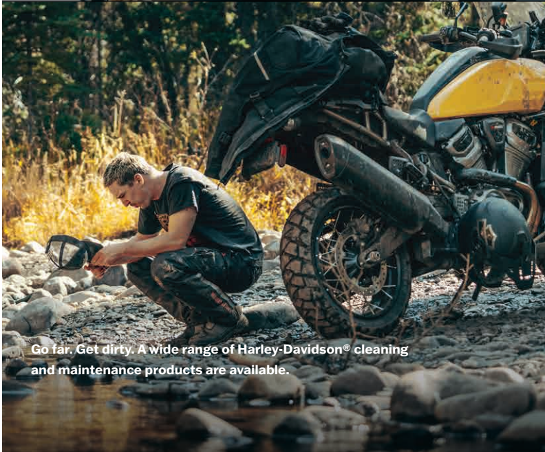
Go far. Get dirty. A wide range of Harley-Davidson® cleaning and maintenance products are available.