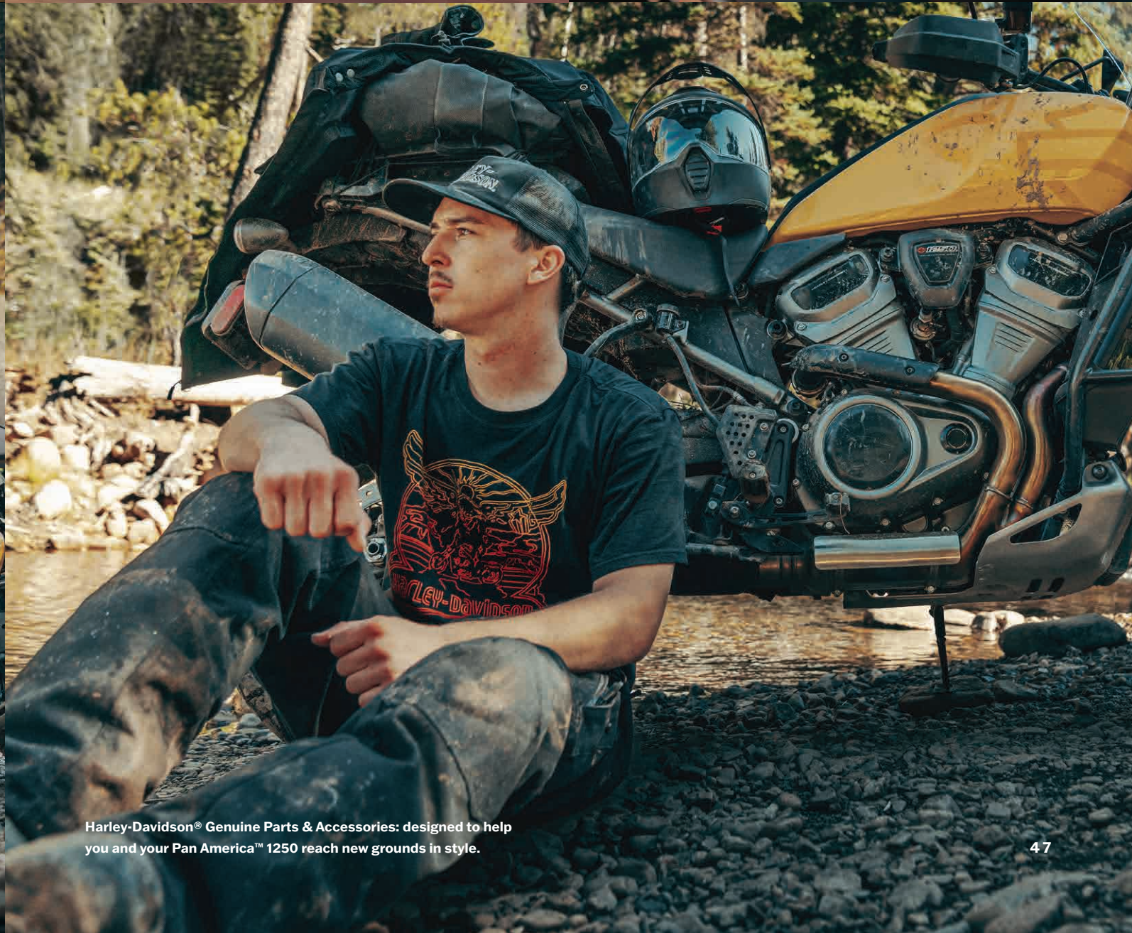
Harley-Davidson® Genuine Parts & Accessories: designed to help you and your Pan America™ 1250 reach new grounds in style.