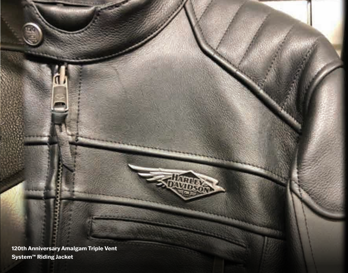
120th Anniversary Amalgam Triple Vent System™ Riding Jacket