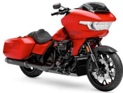
CVO™ ROAD GLIDE® ST