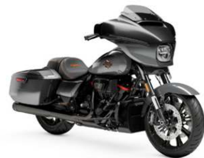
CVO™ STREET GLIDE®