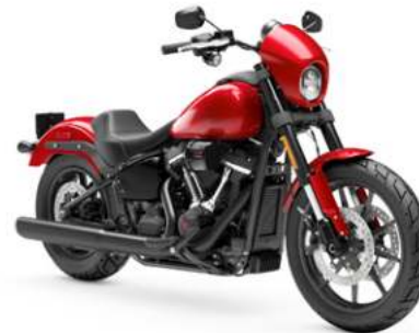
LOW RIDER® S