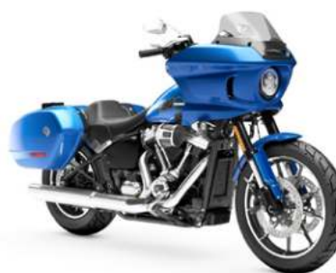
LOW RIDER® ST