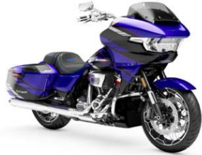
CVO™ ROAD GLIDE®