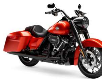
ROAD KING® SPECIAL