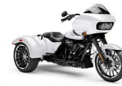
ROAD GLIDE® 3