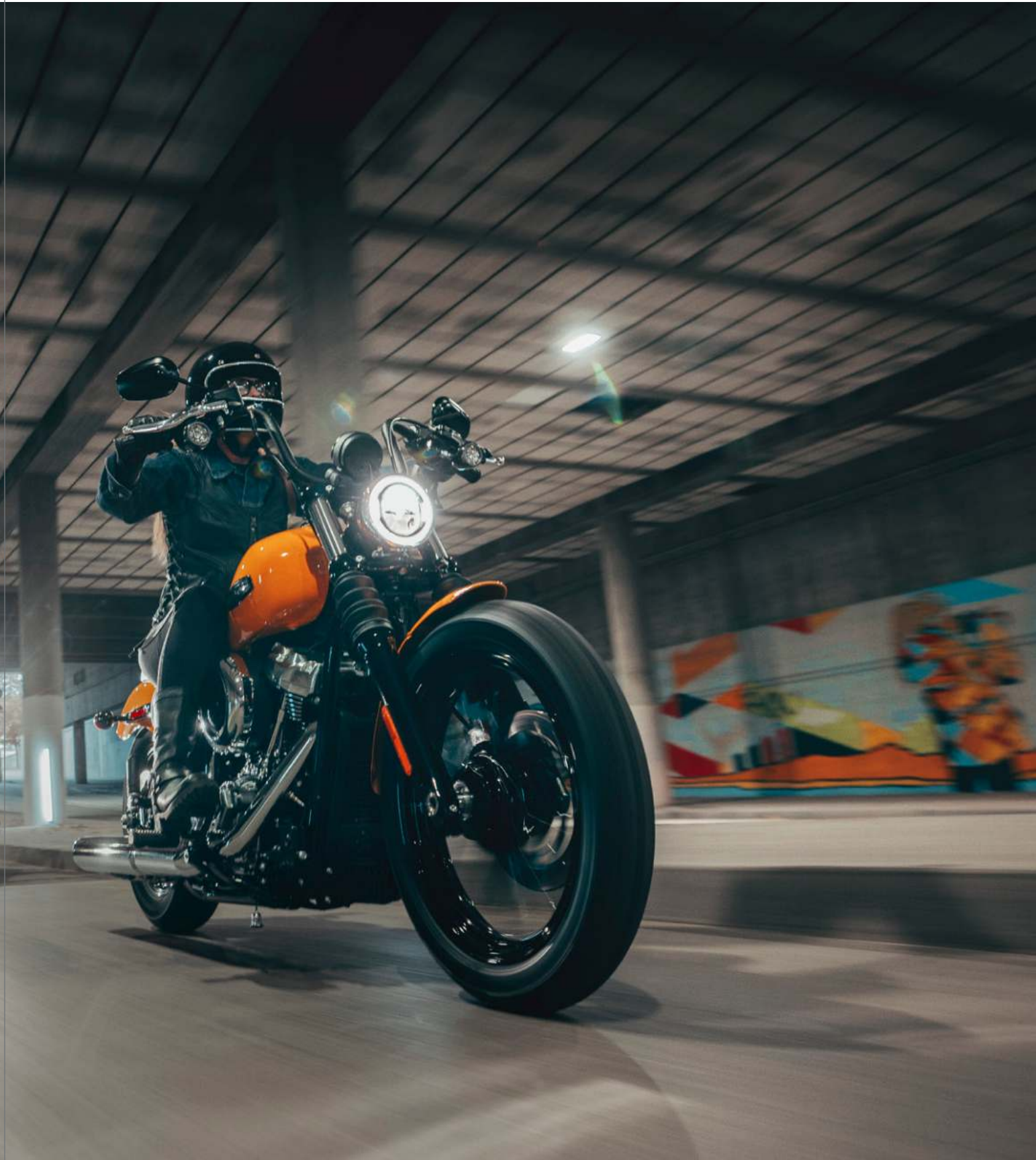
A PACK OF 2025 H-D CRUISERS BLASTING THROUGH SALT LAKE CITY, U.S.A.