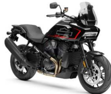
PAN AMERICA® 1250 ST