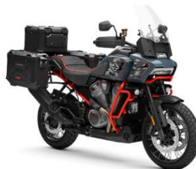
CVO™ PAN AMERICA®