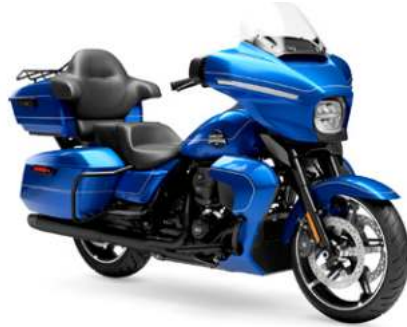
STREET GLIDE® ULTRA