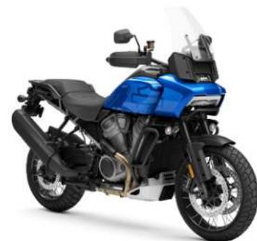
PAN AMERICA® 1250 SPECIAL