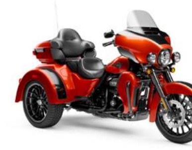
TRI GLIDE® ULTRA