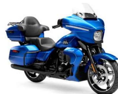
STREET GLIDE® ULTRA