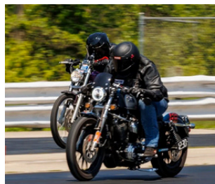
ALL MAKES & MODELS OF MOTORCYCLE WELCOME!