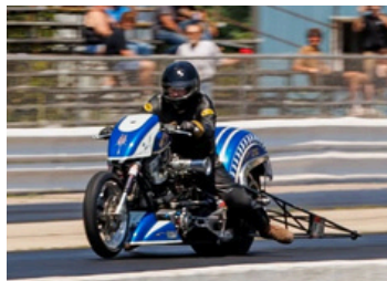
EXPERIENCE THE THUNDER OF NITRO HARLEYS!