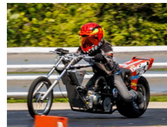
KIDS JR DRAGBIKE RACE 300' HEADS-UP 240CC & UNDER