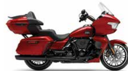
ROAD GLIDE™ LIMITED