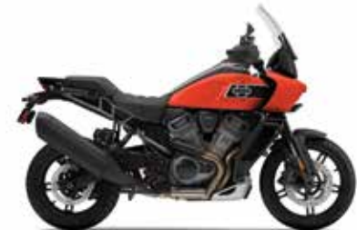
PAN AMERICA™ 1250 SPECIAL