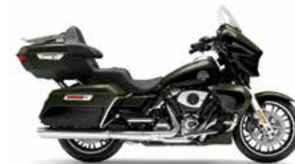
STREET GLIDE™ LIMITED