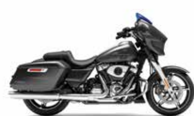
STREET GLIDE™ LIBERTY EDITION