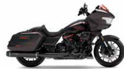
CVO ROAD GLIDE™ ST