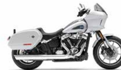
LOW RIDER™ ST