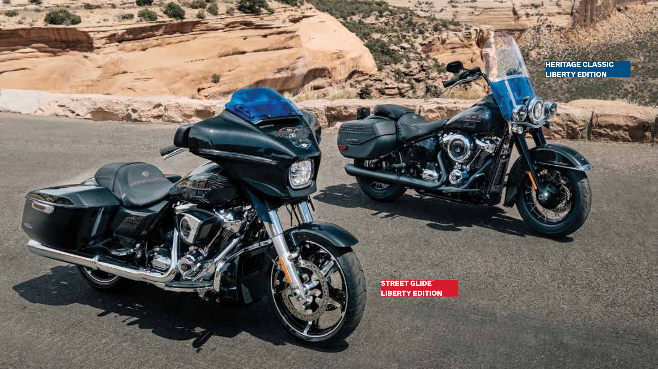
HERITAGE CLASSIC LIBERTY EDITION