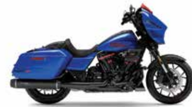
CVO STREET GLIDE™ ST