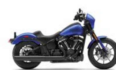
LOW RIDER™ S