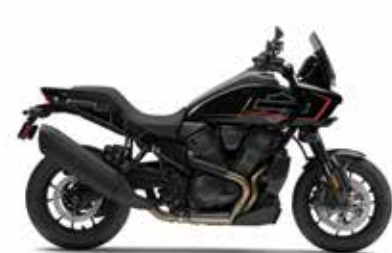
PAN AMERICA™ 1250 ST