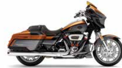
CVO STREET GLIDE™