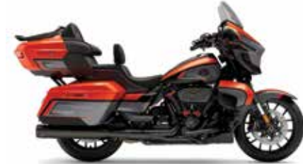
CVO STREET GLIDE™ LIMITED