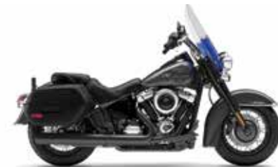
HERITAGE CLASSIC LIBERTY EDITION